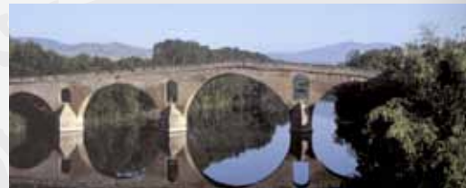
NAVARRE AND THE WAY OF ST JAMES. LAND OF ESTELLA