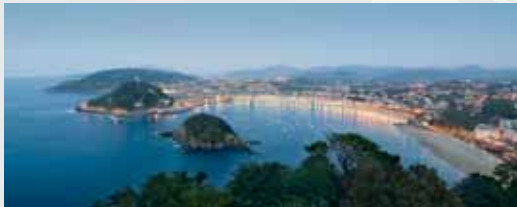
THE REAL NORTH. LAND AND SEA