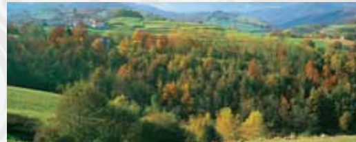
TRADITIONAL NAVARRE. THE BAZTAN VALLEY