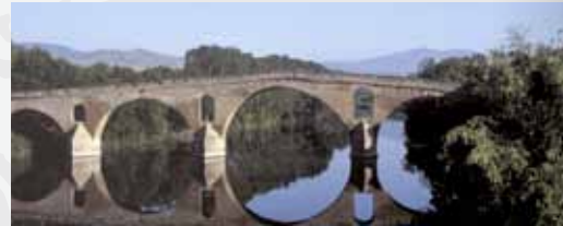
NAVARRE AND THE WAY OF ST JAMES. LAND OF ESTELLA