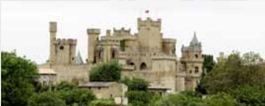
MEDIEVAL NAVARRE. THE CENTRAL AREA