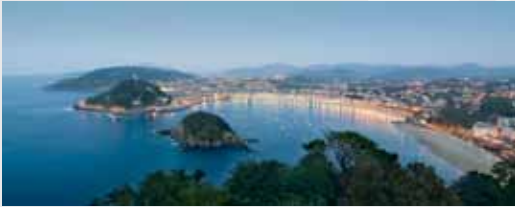
THE REAL NORTH. LAND AND SEA