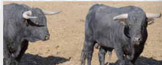
BULLFIGHTS IN NAVARRE. LA RIBERA