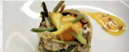
NAVARRE CUISINE. LA RIBERA