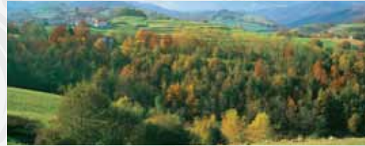
TRADITIONAL NAVARRE. THE BAZTAN VALLEY